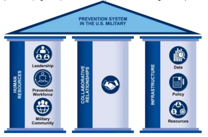
Figure 1). The prevention system enables the planning and coordination of prevention and includes: Human Resources (Leadership, Prevention Workforce, Military Community), Collaborative Relationships, and Infrastructure (Data, Resources, and Policy). Specific steps in the prevention process include understanding the problem and contributing factors, developing a comprehensive approach that targets contributing factors and engages Service members in solutions, implementing the comprehensive approach with fidelity in supportive climates, and evaluating the comprehensive approach. The combination of <u>all</u> of these elements is necessary to decrease the occurrence of harmful behaviors and sustain reductions over time.

To summarize, effective primary prevention involves tackling every step of the prevention process (Figure 2) within a complete and well-organized prevention system (