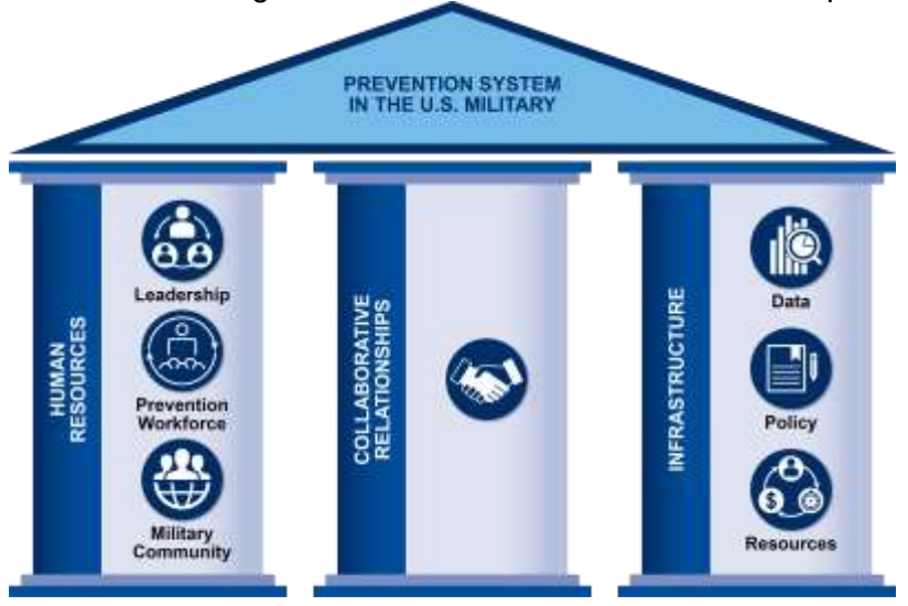
Figure 1): including setting knowledge standards for the prevention workforce, military community, and military leaders, ensuring collaborative relationship are sustained over time, and tracking prevention data, resources, and policies. For prevention programs, policies, and practices, oversight will involve establishing and tracking measures of performance and measures of effectiveness associated with each step of the prevention process (i.e., identifying the problem, developing a comprehensive approach, implementation, and evaluation). In large organizations, oversight becomes critical to ultimately achieving long-term prevention goals. Successful oversight will prioritize outcomes, guide diverse stakeholders, avoid duplication, ensure consistent messaging, and hold organizations and offices accountable for their progress.

involve monitoring and evaluation of each element of the prevention system (see