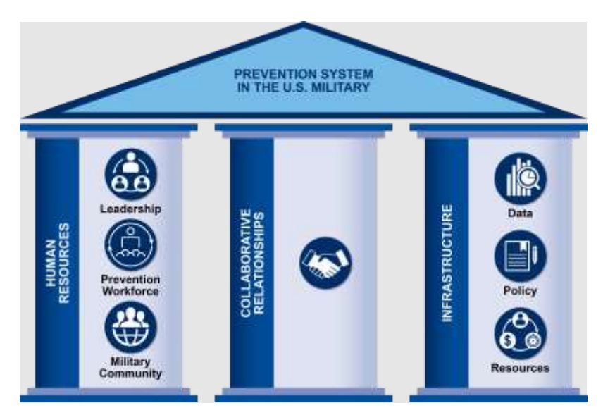
Figure 1. Primary Prevention System

The prevention system is the backdrop against which prevention planning, implementation, and evaluation all take place. A gap or deficiency in any element of the prevention system (e.g., an unskilled or underqualified prevention workforce) will degrade the quality of prevention activities.